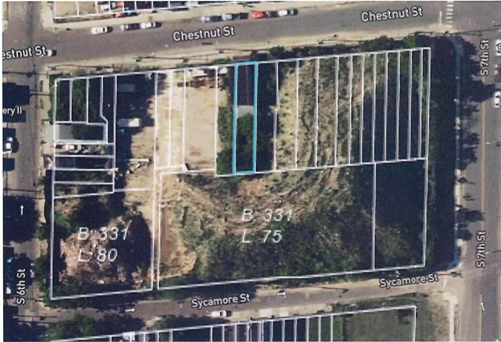
Aerial View of Block 331